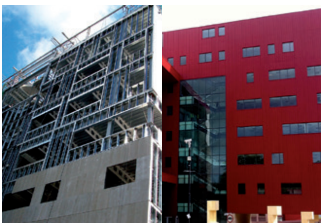
Figure 6 Light steel external walling at Barnsley College