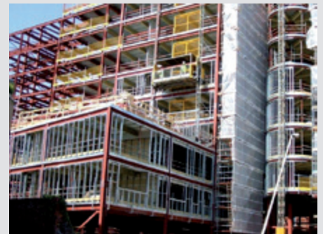
Flat and curved light steel infill walls