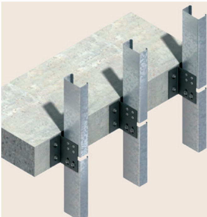
Figure 8 Bracket connection for continuous walling incorporating slotted connections

The continuous external wall system consists of vertical light steel C sections and bracket connections to fix them to the primary frame. Allowance for movement of the primary frame must be incorporated into the connections, usually by use of slotted connections (see Figure 8).