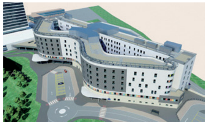
Figure 9 Light steel infill walling used on Victoria Hospital, Kirkcaldy, Fife