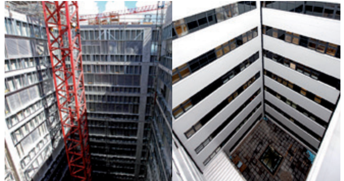
Figure 2 Large window openings in light steel walling

Large windows up to 3 m high and 5 m wide can be created using multiple C sections next to the openings; this is not possible with other forms of infill walls. Wind posts cantilevered from the floor slab may be required to reduce the span length for large windows. The design flexibility and ease of construction of light steel means that the infill wall can easily be constructed around columns and bracing for the primary structural frame.