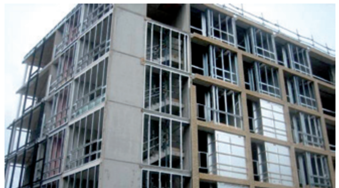
Figure 3 Light steel infill walls in a concrete frame building

Balconies can also be incorporated into light steel external wall systems. Figure 4 shows light steel balconies fixed back to the primary concrete frame and integrated with a panelised light steel wall system.