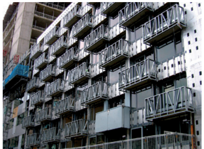
Figure 4 Light steel external wall system with integrated balconies

Balconies can also be incorporated into light steel external wall systems. Figure 4 shows light steel balconies fixed back to the primary concrete frame and integrated with a panelised light steel wall system.