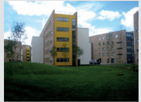
Light steel infill walls at Brunel University, with a variety of claddings

Wall panels can be pre-fabricated as storey-high units or, more often, are site assembled from C sections that are delivered cut-to-length. The second approach is often the only feasible solution in renovation applications, where deviations in the original construction have to be accommodated.