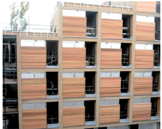
Figure 7 Cedar cladding on light steel infill walling

The sheathing board also adds to the air-tightness of the façade. It may be in the form of cement particle board, calcium silicate board or, for insulated render applications, moisture resistant plasterboard.