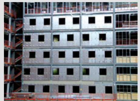
Pre-fabricated light steel infill panels