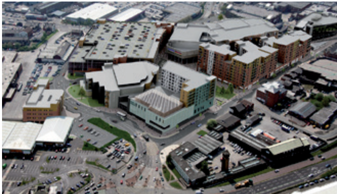
Figure 5 Light steel external walling used in a mixed use development, The Rock, Bury